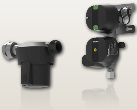
Truma DuoControl CS incl. gas filter