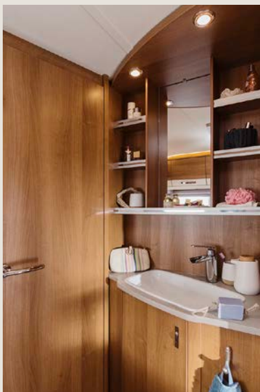
DA VINCI 490 TD

MORE comfort: The spaciouly designed bathroom is features a luxury shower cubicle.