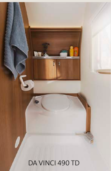
DA VINCI 490 TD

For anyone who has ever toyed with the idea of buying a TABBERT, now is the perfect time to fulfil your dream. The popular DA VINCI is now available as a FINEST EDITION in 11 floorplan versions perfect for families and couples. The already well-equipped motorhome is available as a special edition with lots of useful extras: more design, more comfort, more safety, more technology and more room for luggage, thanks to the load increase of the AL-KO chassis. Welcome to the TABBERT interpretation of MORE!