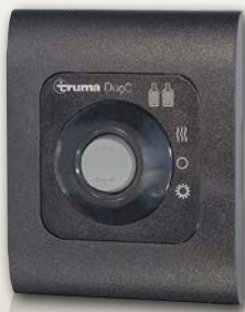
Remote display DuoC (integrated anti icing)