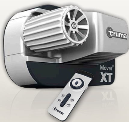
Truma Mover® XT