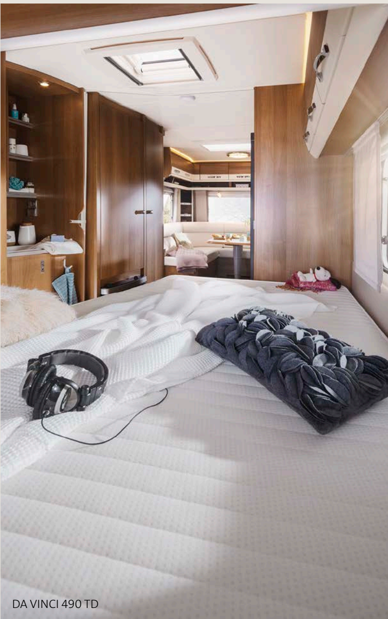
DA VINCI 490 TD

MORE room: The well-conceived DA VINCI kitchen convinces with spacious drawers and a large refrigerator.