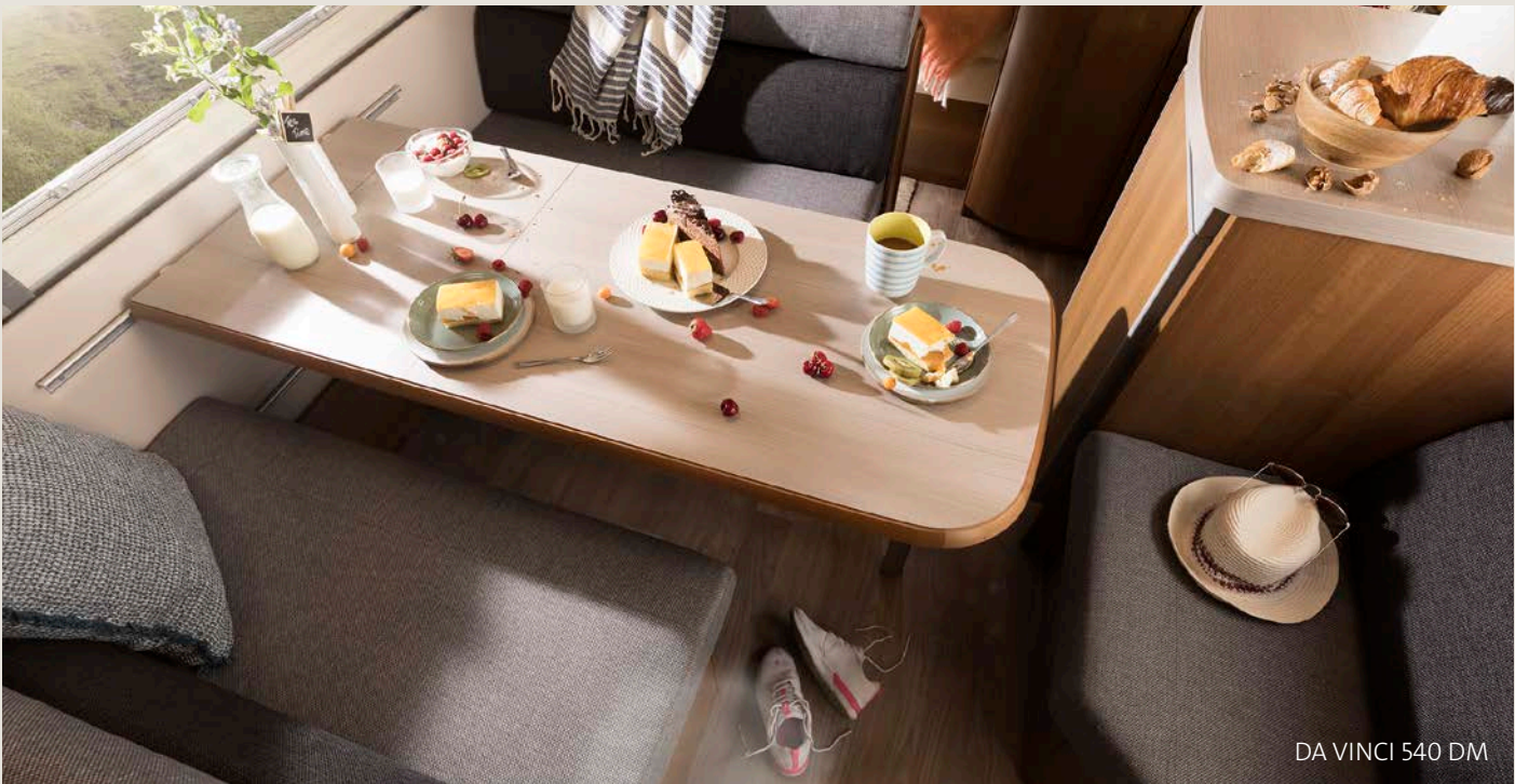
DA VINCI 540 DM

MORE spaciousness: The attractive “Noce Opera Caramel” design with the white applications, which have a leather-like feel, on the overhead cupboards, gently guides the eye from the high-quality upholstered round seating group to the sleeping area.