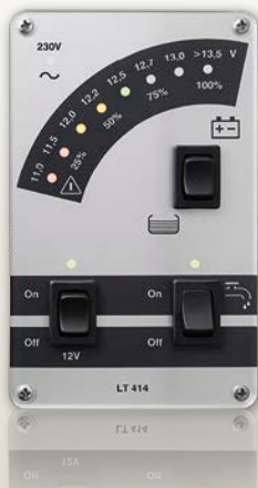
12 V power supply package