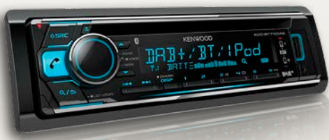
Radio DAB+/CD/MP3 with USB and Bluetooth