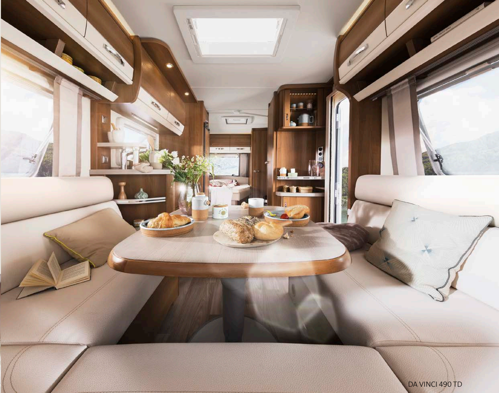
DA VINCI 490 TD

MORE relaxation: The TABBERT comfort sleep system with water gel mattresses has a relaxing effect and provides simultaneous cooling.