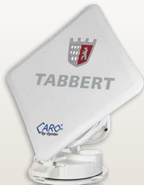
Antenna package CARO®+